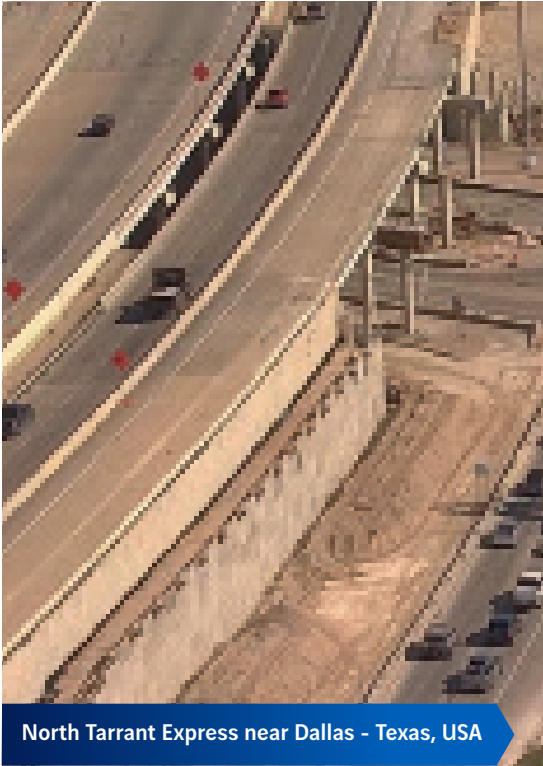
North Tarrant Express near Dallas - Texas, USA

As the world leader in mechanically stabilised earth , Geoquest has a presence in five continents, and benefits from both local and international expertise.