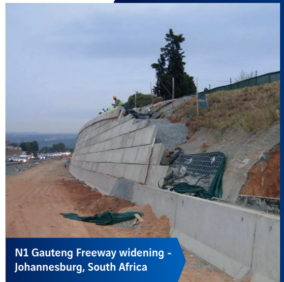
N1 Gauteng Freeway widening - Johannesburg, South Africa