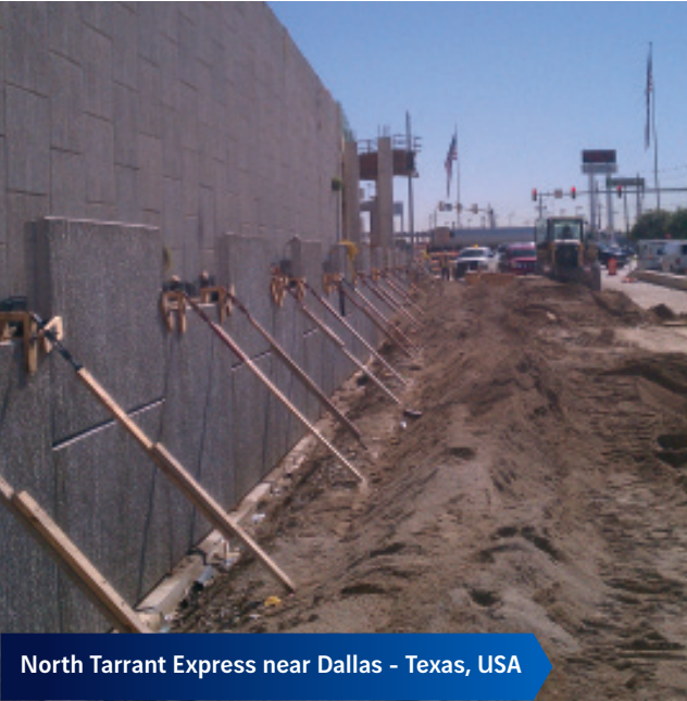
North Tarrant Express near Dallas - Texas, USA