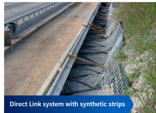
Direct Link system with synthetic strips