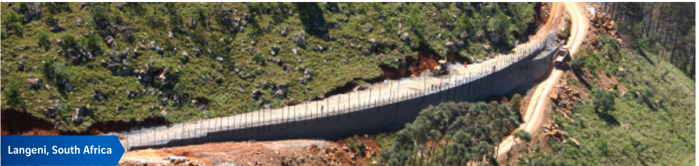
Langeni, South Africa

This wealth of expertise has led Geoquest to develop processes offering common advantages: