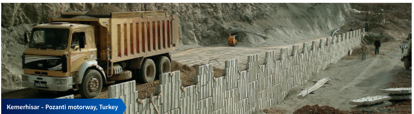
Kemerhisar - Pozanti motorway, Turkey