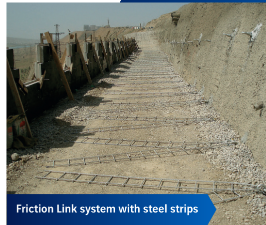
Friction Link system with steel strips

TerraLink® elements are similar to those used for Reinforced Earth® solution: soil reinforcements (steel or geosynthetic), connected to modular facing systems (precast concrete panels, welded wire mesh and connection parts). These elements are placed between well compacted backfill layers. The main feature is that reinforcements are linked to the rear part (backface) of the system through the existing structure, which enables combination or continuity of the reinforcements between the narrow Reinforced Earth® wall and the existing structure.