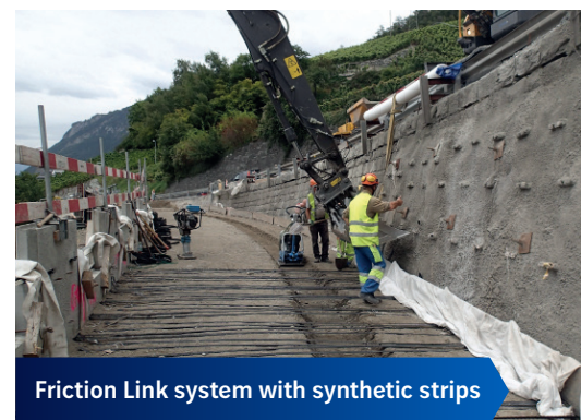
Friction Link system with synthetic strips