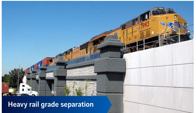
Heavy rail grade separation