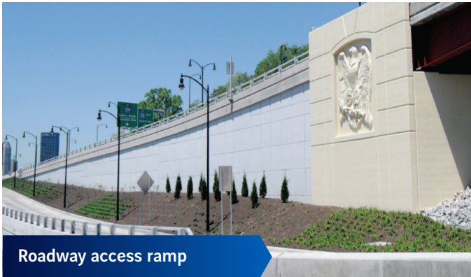
Roadway access ramp

Since 1986, more than 900,000 m 2 of T-Wall® have been constructed, and together with wall heights exceeding 15 m give confidence to stakeholders in the performance of T-Wall® structures. Geoquest engineers work closely with developers and builders from project inception to completion. Discover some of our T-Wall® applications or contact us for a list of project references.