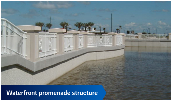
Waterfront promenade structure