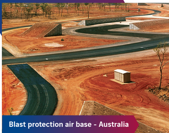
Blast protection air base - Australia

Reinforced Earth® has proven to be a highly stable explosion barrier that impedes the propagation of a blast at ground level and absorbs high levels of energy due to its tolerance for deformation. Moreover, our structures minimise the dispersal of debris during an explosion. Dimensions of the structures can be customised for the asset to be protected.