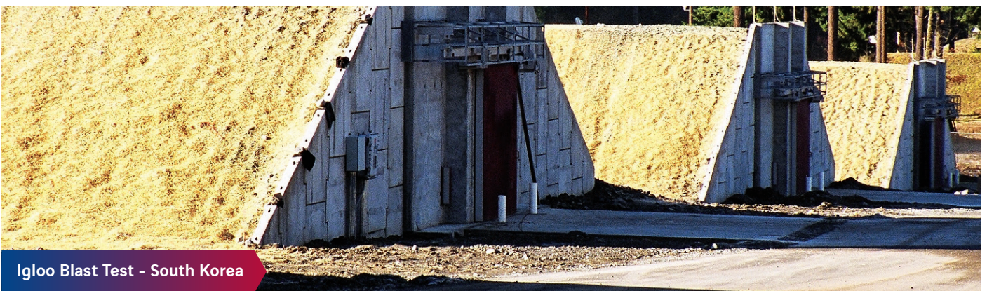
Igloo Blast Test - South Korea