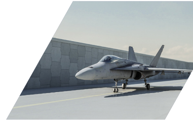
Protective walls and shields