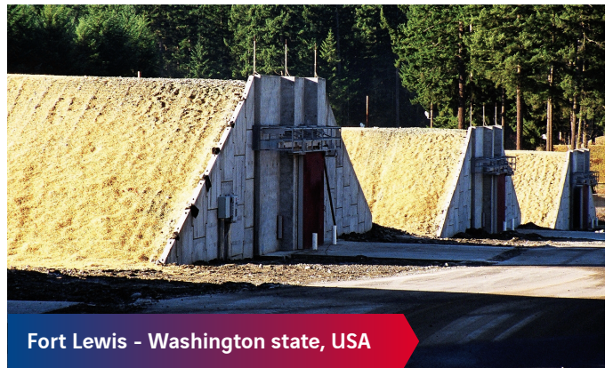
Fort Lewis - Washington state, USA