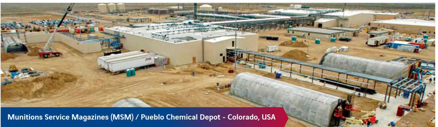
Munitions Service Magazines (MSM) / Pueblo Chemical Depot - Colorado, USA