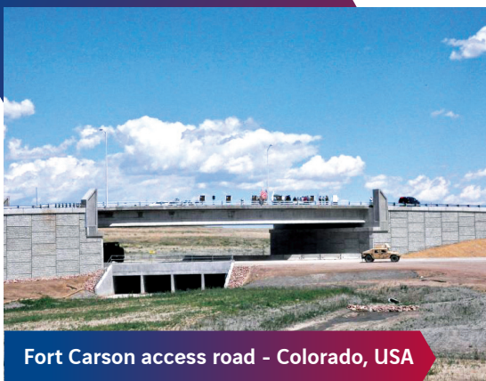
Fort Carson access road - Colorado, USA