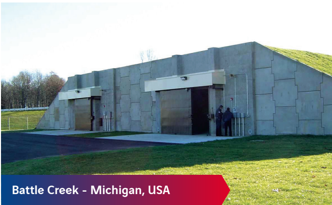
Battle Creek - Michigan, USA