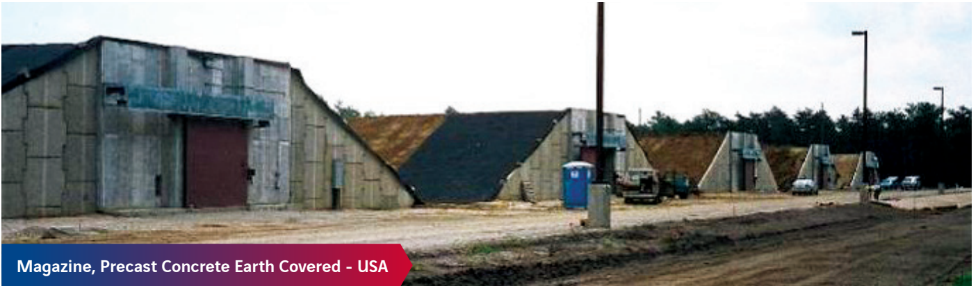
Magazine, Precast Concrete Earth Covered - USA