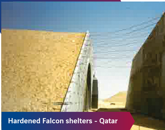
Hardened Falcon shelters - Qatar