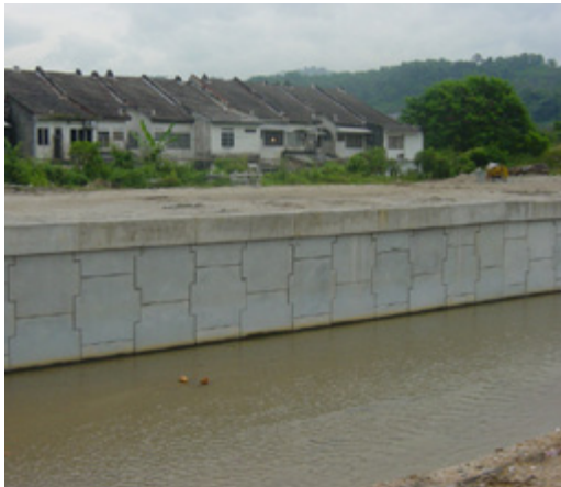
Ampang Waterfront, Kuala Lumpur (Malaysia)