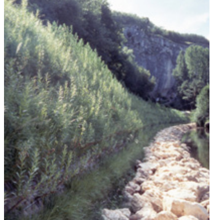
Les Eyzies de Tayac (France,