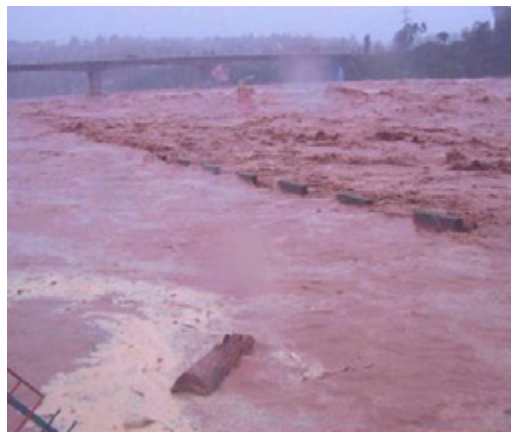
Towi river Iommu (India