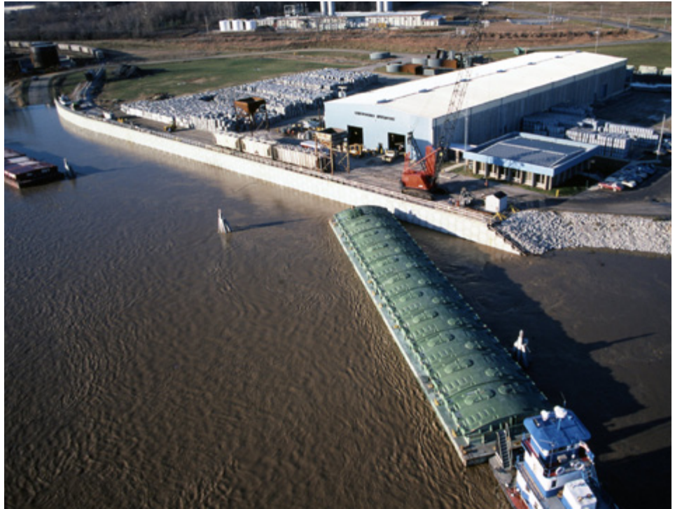
Owensboro, Kentucku (USA)