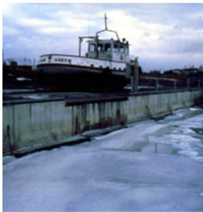
Prescott, Ontario (Canada)