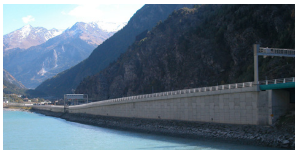
A43 Motorway (France)

Drawing on their global expertise and track record, Reinforced Earth entities worldwide bring tailor-made solutions and provide support at all stages of the projects, fulfilling the demanding requirements of rivers and waterways hydraulic applications.