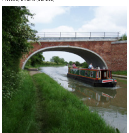
Banbury Lane (United Kingdom)