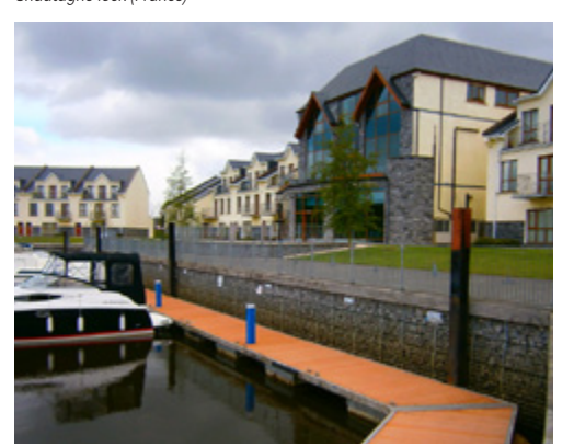
Chautaane lock (France)